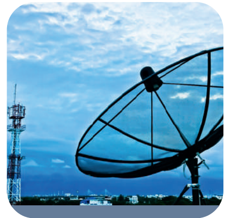
IT & TELECOM